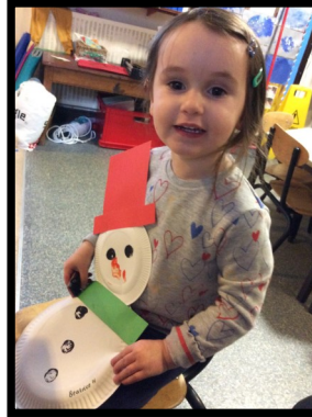
Frosty the snowman.