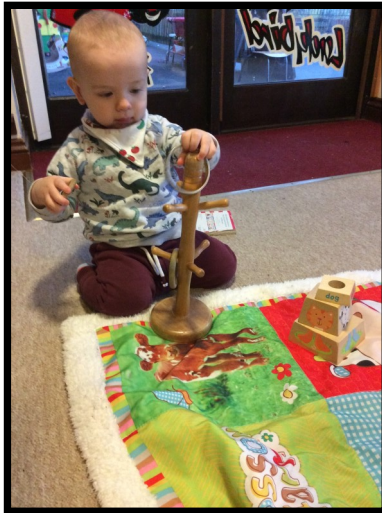
Showing good concentration hooking the rings on.