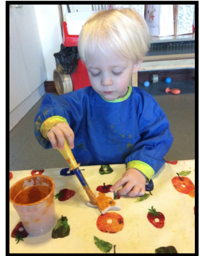
Painting Christmas Tree decorations.