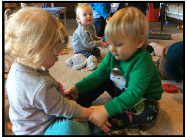
Row, row, row the boat.