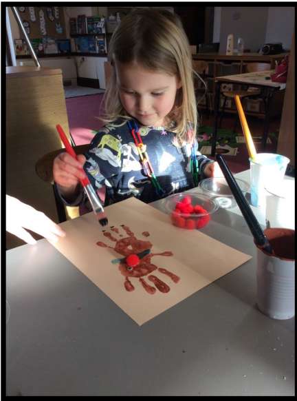
Creating Rudolf with our handprints.