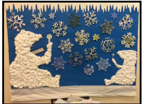
The children have been working hard to create these amazing wintery displays.