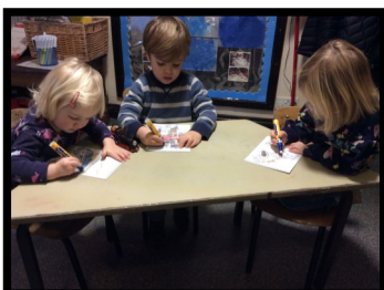
Exploring our new resources.