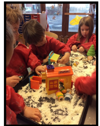
We used small world toys in our pretend snow.