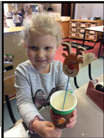
Plenty of Christmas art and craft.