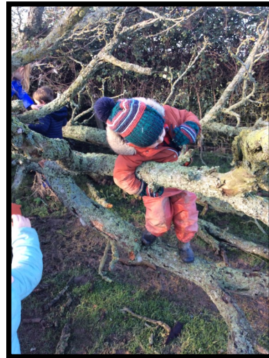
Look how we can climb.