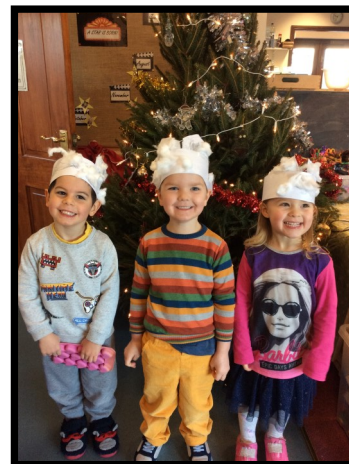
We made sheep masks to practise the Nativity story.