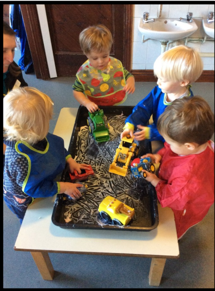
Having fun exploring the sensory tray.