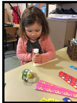
Christmas paper chains.