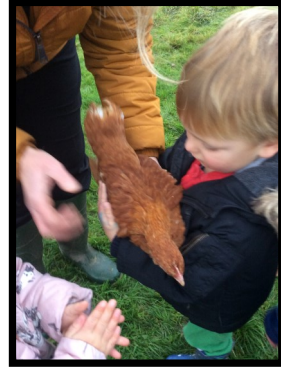
Helping to move the chickens into their new house and giving them a cuddle too!