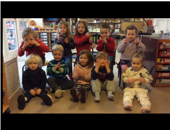
Little Squirrels Christmas choir.