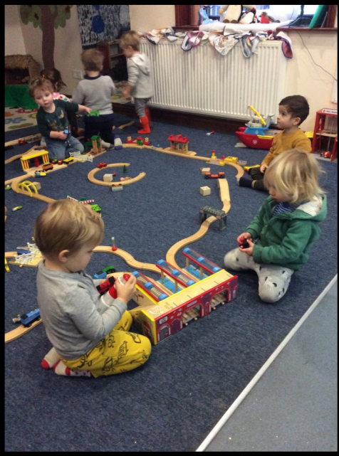
Playing with our new train track!