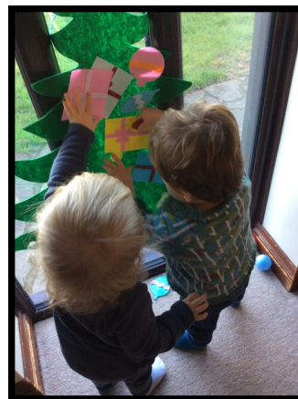
Decorating the tree.