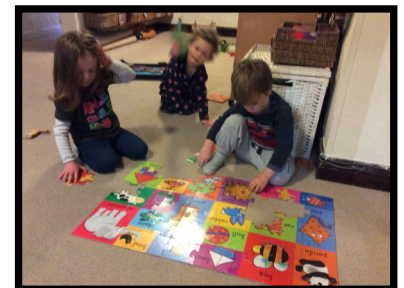
Working together to complete the puzzle.