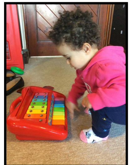
Playing some tunes.