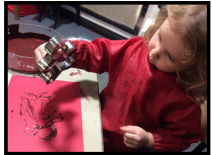
Gingerbread people painting.