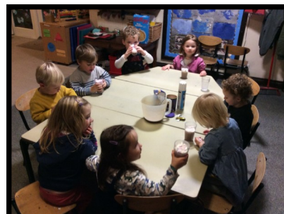
Making and enjoying a hot chocolate.