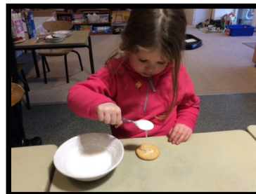
Making Snowmen biscuits.