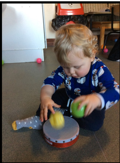
Exploring with the sounds the balls make on the tambourine.