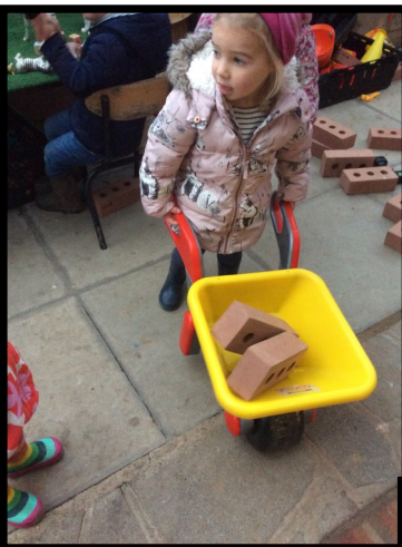
Enjoying the Builders roll play.