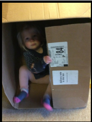
This box makes a great den!