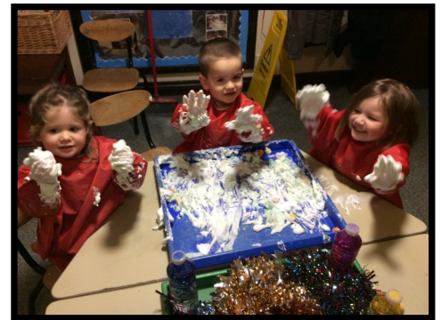
Wintery sensory tray!