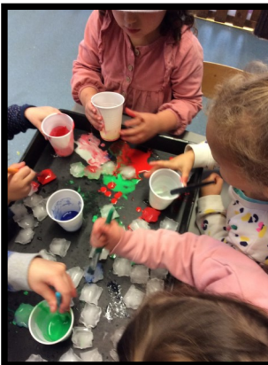
Mixing colours on ice.