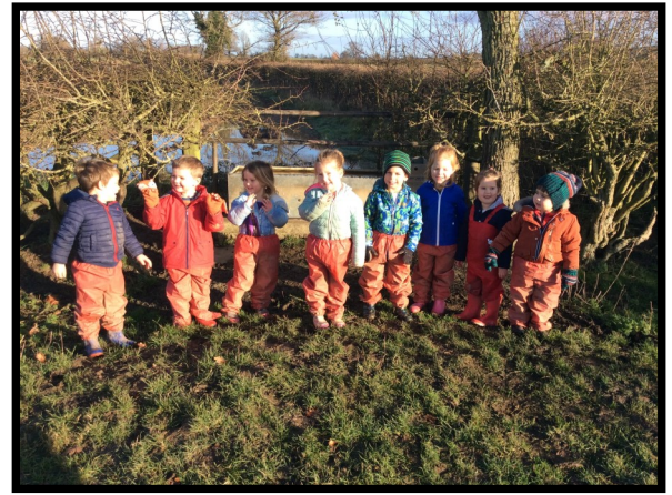
Enjoying a muddy winter walk.